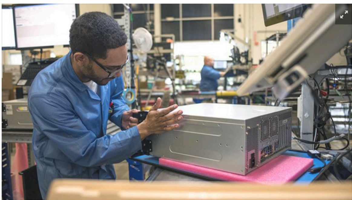
An employee working on the Dedicated Computing production floor in Waukesha.